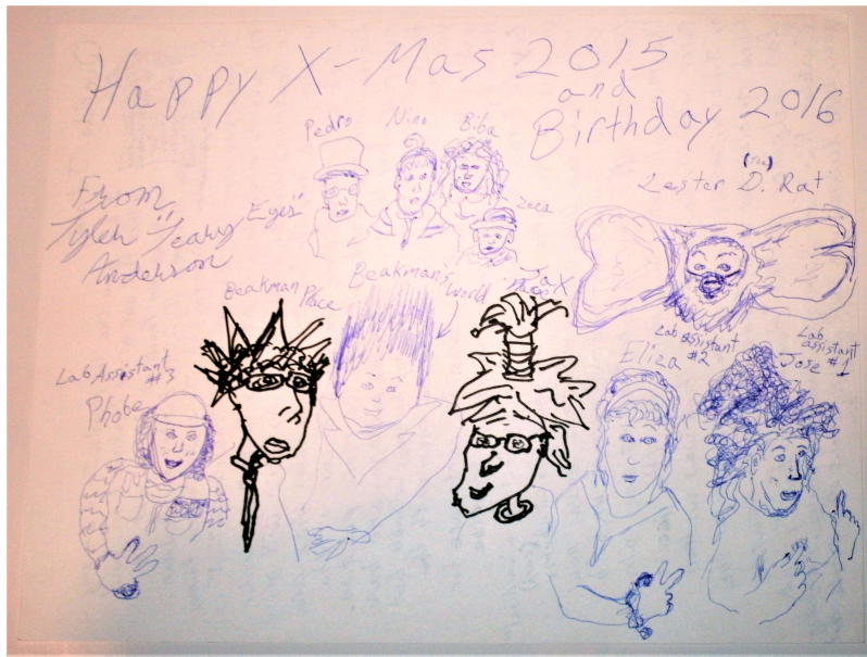
Happy X-Mas 2015 and Birthday 2016 . {Personal X-Mas greeting illustration.}